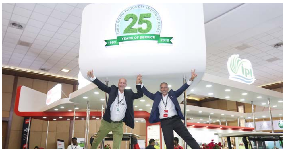
Celebrating 25 Years of Service