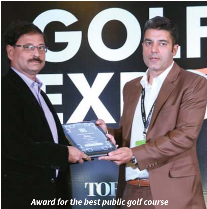
Award for the best public golf course