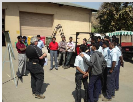
Oxford Golf & Country Club