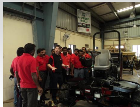
CIDCO – Khargar Valley Golf Course