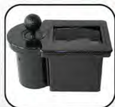
Club & Ball Washer