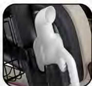
Sand Bottle Kit