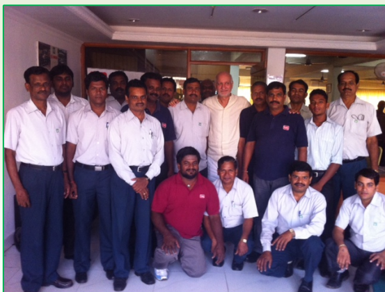
IPI SERVICE MEET AT CHENNAI

His passing away is indeed a great loss to the golfing fraternity. IPI will forever miss his charismatic presence and vision.